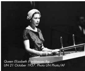
Queen Elizabeth II addresses the UN 21 October 1957.