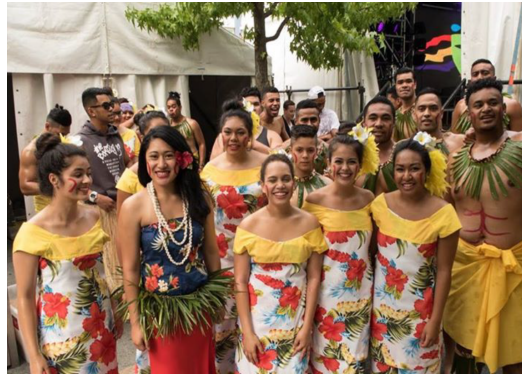
United Nesian Movement of Canberra

4. 40pm - General Discussion by Conference Participants regarding the problem of continuing illegal trafficking of kava from Eastern Australia to the Northern Territory and beyond. For Federal Government, this is one of the main reasons for their late attempt and plan to ban kava totally.