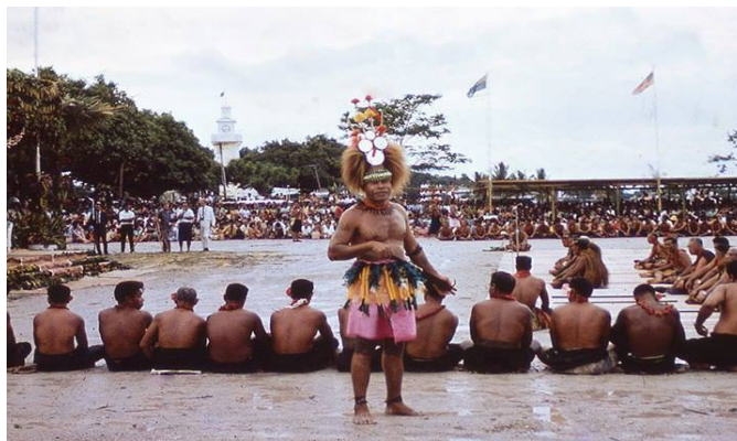
Samoan Chiefly 'Ava Ceremony