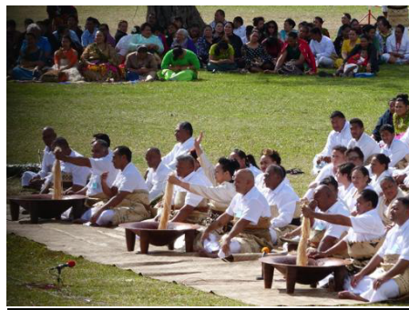
HRH Princess Lātūfuipeka Tuku'a in the central tano'a mixing the Royal kava in the Coronation of HM King Tupou VI

Kava ceremony, as well as a product, is increasingly controversial worldwide than ever before in its entire history within the Moanan region, and between them and the Western capitalist market with its promotion of pharmaceutical industries, as well as, health concerns. On one hand, Moanan kava culture in the region, and among Moanans living in Western societies, is confronting the international complex and increasing encroachment of capitalism, pharmaceutical interests and health concerns. On the other hand, the issue of cultural and religious rights in kava is seen as opposed to the above international complex and increasing encroachment. So, the Conference will attempt to provide positive answers, ideas, solutions and strategies to the said complex and increasing controversy. The whole Conference will be videoed by the United Nesian Movement of Canberra for their own record, as well as, to present a copy to both the Australian Capital Territory and Federal Government of Australia. All papers from such a Conference will also be incorporated as Chapters of the upcoming book on kava deducing and developing from the First International Kava Conference by the Australian-World Kava Movement and Lo'au University in 2011 at the Australian National University.