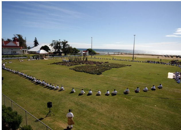
Pangai Lahi Oval in Nuku'alofa the Capital of the Kingdom of Tonga: Royal Kava Ceremony in the Coronation of HM King Tupou V in 2008

8.30 – Registration of $30 per participant but $15 for pensioners and students (Only for those who haven't paid their registration on Friday 4 th and Saturday 5 th )