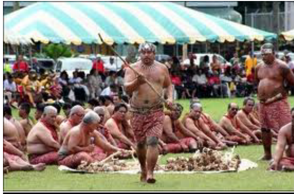
Samoan chiefly 'Ava