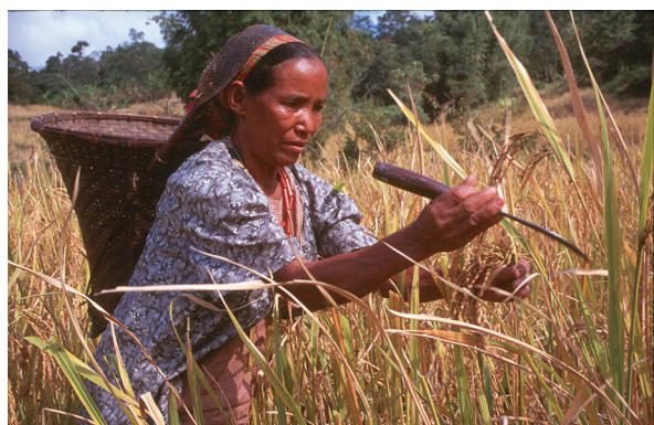
PLATE 4: An Angami shifting cultivator deftly harvests her swidden rice and deposits it in the basket on her back.

With your collective wide experience in this field, I suspect that there must be some really interesting shots amongst your personal photo archives, and we'd love to include a few of them in this next volume! I emphasize that we are extremely careful in making sure that the contributing photographer is properly accredited! If any of your photos are selected for publication, then we will get back to you later to seek your help in developing an appropriate caption to accompany it.