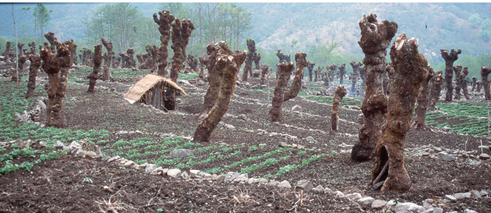
PLATE 3: In Nagaland, Khonoma village’s system of managing alder trees in its jhum fields is a prime example of the

Besides written contributions, we also seek high-quality, coloured photographs of farmer innovations and best practices in shifting cultivation in Asia-Pacific to help illustrate the volume. We plan that the volume will include a section of coloured plates, just as previous volumes had. Or, if your high-quality photos are of shifting cultivation more generally, they would also be very