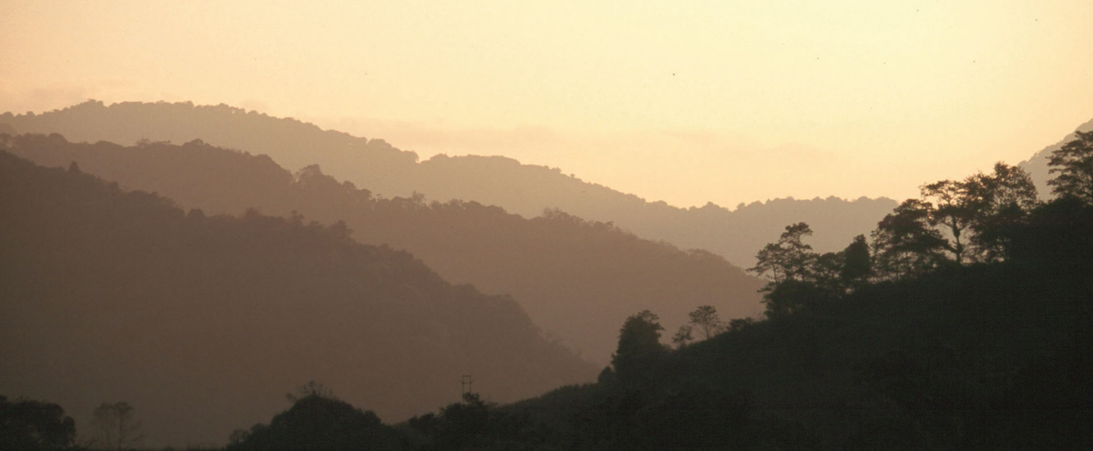
PLATE 1: The Naga Hills, in Northeast India, take on a golden hue as the sun begins to set.